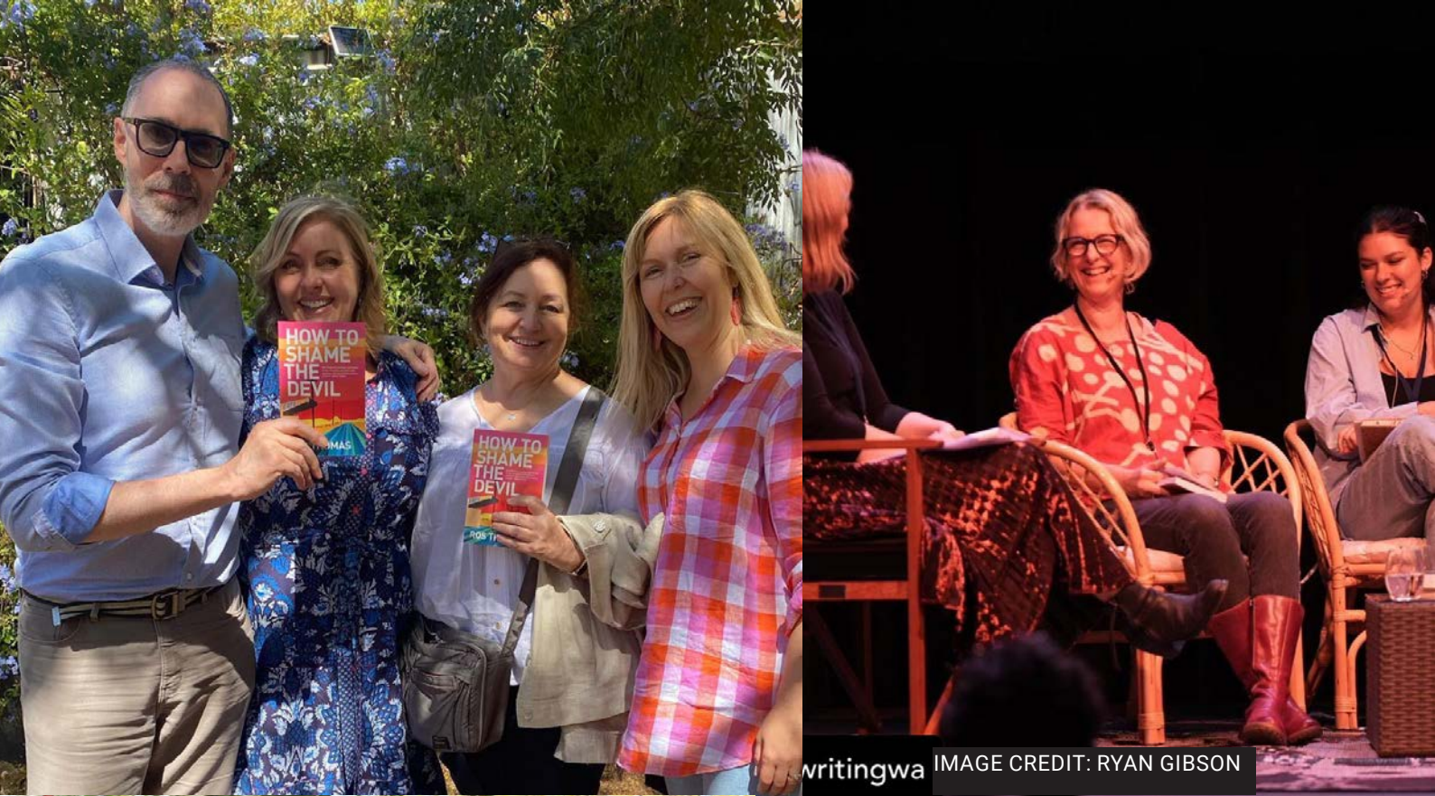
writingwa