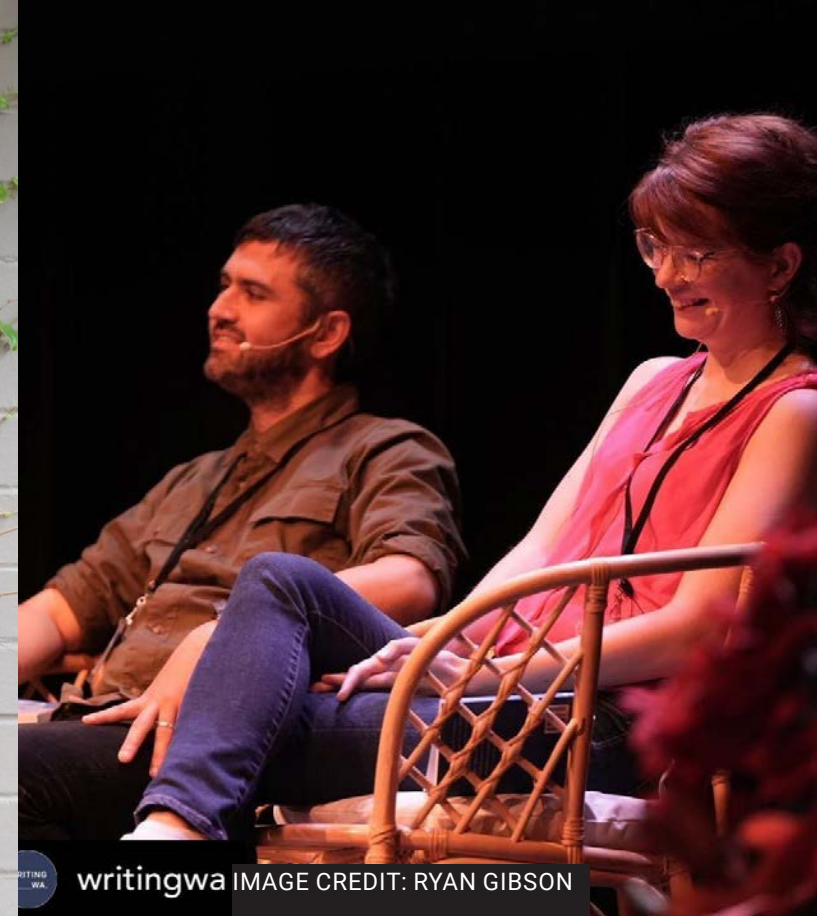
writingwa